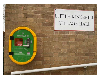
The defibrillator at Little Kingshill Village Hall

If you wish to donate to South Central Ambulance Charity the website is www.scascharity.org.uk