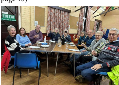
A meeting of the Prestwood Wine Club

Places must be booked in advance so that there is enough wine. Meetings are at the Village Hall and are usually the 3rd Monday of the month. (see page 13)